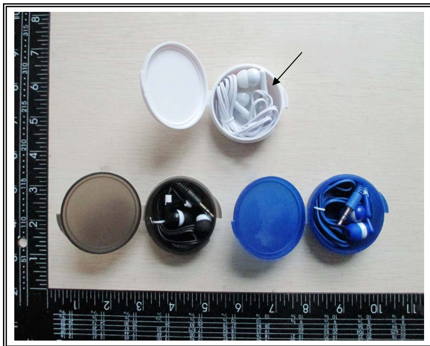
Test item: EARPHONE WITH PP BOX